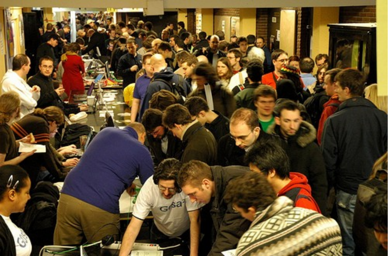
Fedora Community at FOSDEM