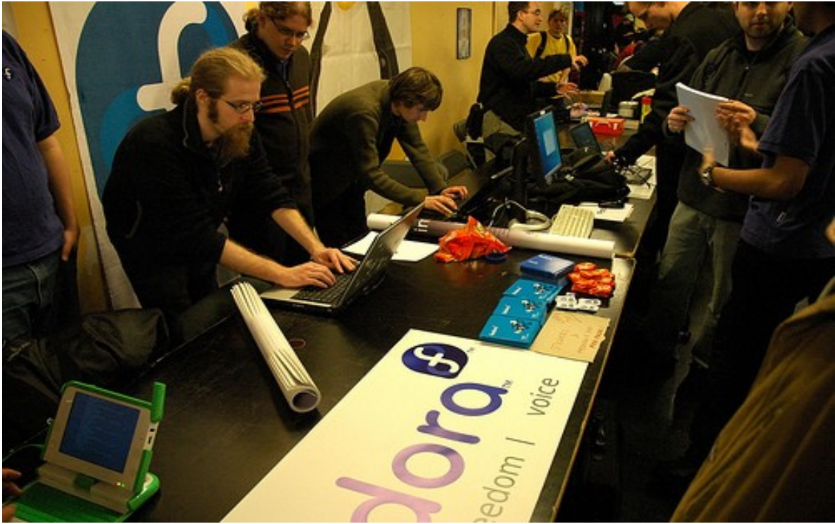
Fedora Community at FOSDEM